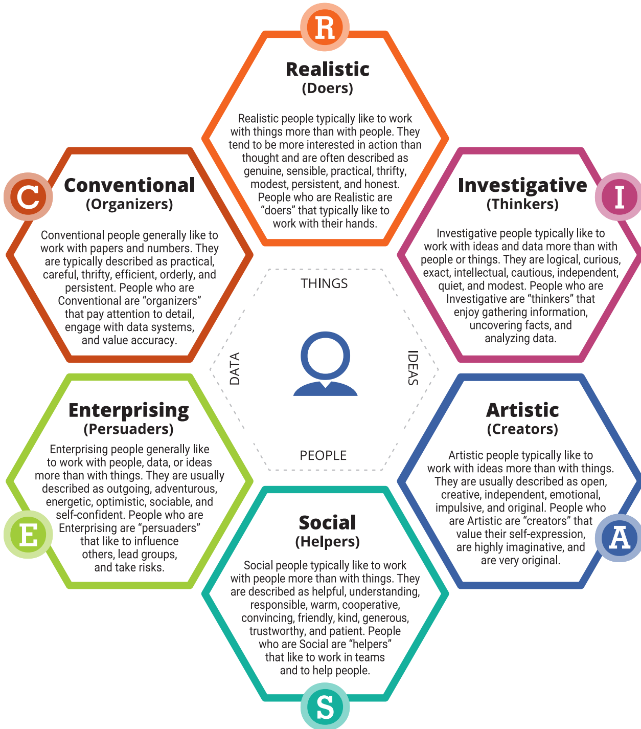
Figure 4: The RIASEC model with brief descriptions of the domains.

There are a lot of very good models of Career Interests. John Holland’s World of Work and the RIASEC model of career interests are among the most common and time-tested. The RIASEC model has also provided a basis for academic and applied psychological research.