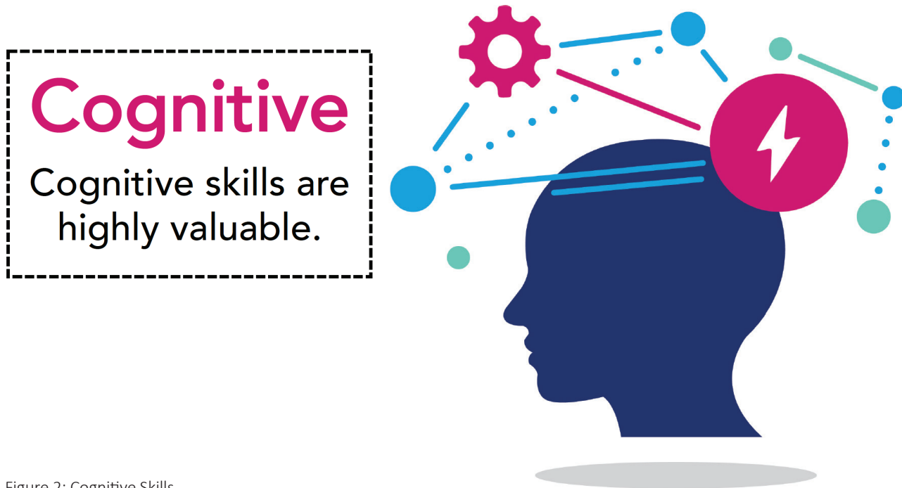
Figure 2: Cognitive Skills

By combining reading, forms and math, the Thinking Skills assessment gives us a reliable measure of overall cognitive skills. Most employees are problem solving specialists and so most jobs value competencies like critical thinking, problem solving, and judgment and decision making. The overall JOFI cognitive score is a reliable indicator of these skills.